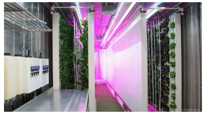
Fig. 1: Neon Red lights for hydroponic farms in containers (Brad and Jon, 2013).

• Plant physiology to computer science can diminish the complexities and controversies of sustainability by Catherine Arnold (Brad and Jon, 2013).