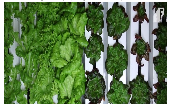
Fig. 2: Lettuce plants using hydroponics (Brad and Jon, 2013).

• Mixture of nutrients and water solution is supplied in closed loops using hydroponic delivery system.